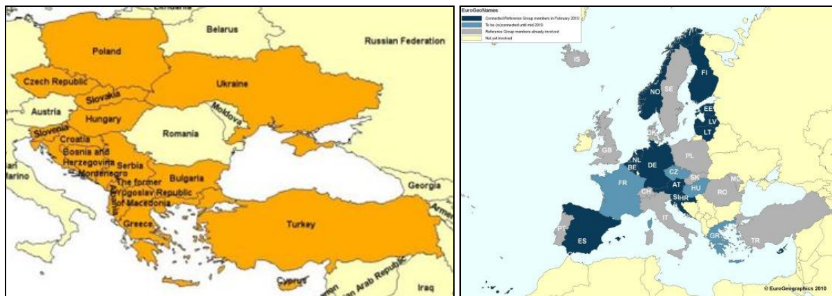
Figure 5. ECSEE Division member countries and EuroGeoNames countries.