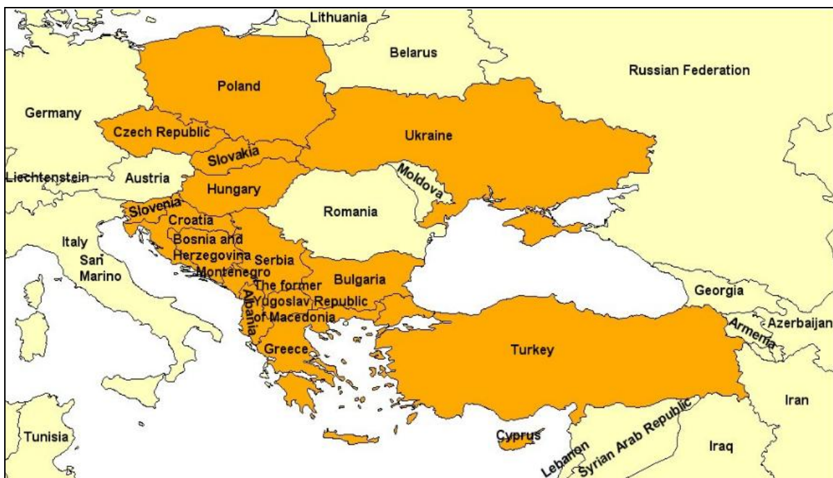
Figure 1. ECSEED countries.

With Montenegro joining ECSEE Division at the 19th ECSEED Session, ECSEE Division has reached the number of 16 member countries: Albania, Bosnia and Herzegovina, Bulgaria, Croatia, Cyprus, Czech Republic, Greece, Hungary, Montenegro, Poland, Serbia, Slovakia, Slovenia, The former Yugoslav Republic of Macedonia, Turkey and Ukraine (see Fig. 1).