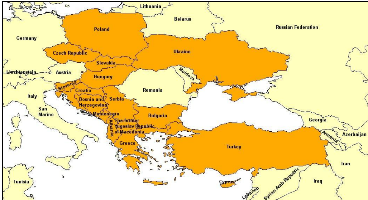
Fig. 2: East Central and South-East Europe Division countries.

Sixteen countries are active in the East Central and South-East Europe Division: Albania, Bosnia and Herzegovina, Bulgaria, Croatia, Cyprus, Czech Republic, Greece, Hungary, Montenegro, Poland, Serbia, Slovakia, Slovenia, The former Yugoslav Republic of Macedonia, Turkey and Ukraine (s. Fig. 2).