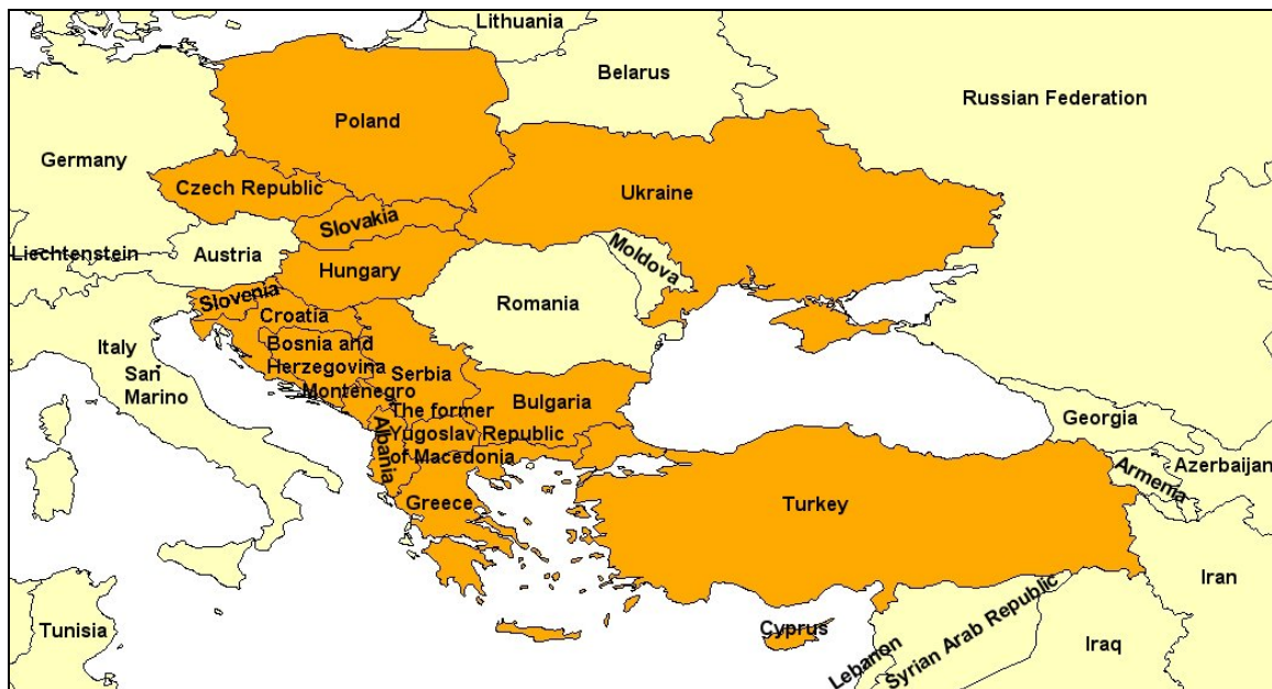
Fig. 1: East Central and South-East Europe Division of UNGEGN.

Fifteen countries are active in the East Central and South-East Europe Division: Albania, Bosnia and Herzegovina, Bulgaria, Croatia, Cyprus, Czech Republic, Greece, Hungary, Poland, Serbia, Slovakia, Slovenia, The former Yugoslav Republic of Macedonia, Turkey and Ukraine (s. Fig. 1). Montenegro was activated in ECSEED at this session as a new Division country.